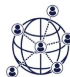
Solution & Service Providers