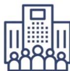
Government & Commercial